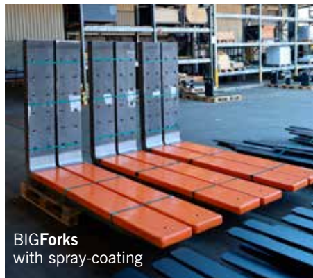
BIGForks with spray-coating