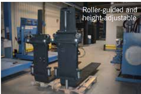
Roller-guided and height-adjustable

VETTER BigForks are individually manufactured according to customer requirements. From different suspensions to CROC ® anti-slip coatings on the fork blade or ATEX forks for hazardous areas to the integrated camera and sensor technology of the SmartFork ® product family - we develop your customised fork solution.