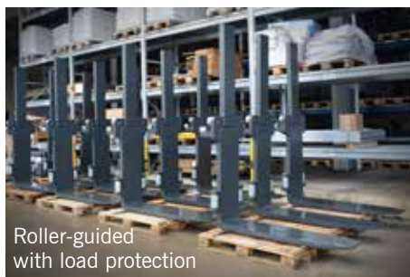
Roller-guided with load protection