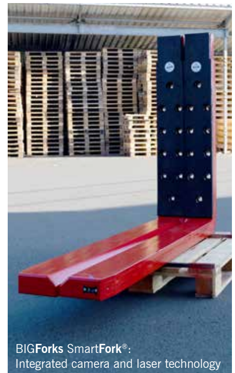
BIGForks SmartFork ® : Integrated camera and laser technology

The illustrations only represent the basic principles and do not constitute a contractual entitlement. © VETTER Industrie GmbH • 10/2023 • PI-62-EN